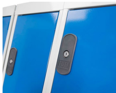
Lock close up